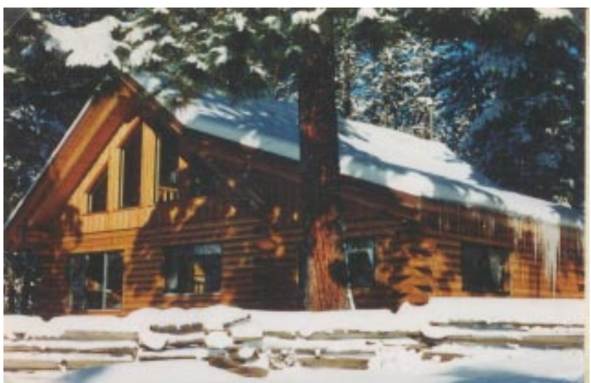
Logs are of dead standing lodgepole pine.