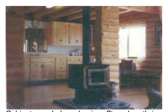
Cabinets are lodgepole pine. Stove hearth is made of white sand and masons cement using granite and marble stone set in a single iron framework. The floor is also lodgepole pine.