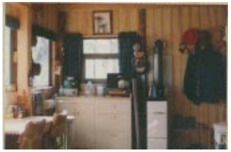
The 22X40 foot pole building we lived in for four year. Our living space was 12X22 feet.