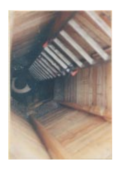
Walls of temporary wood framing holding the cement against the bank to provide the well casing.