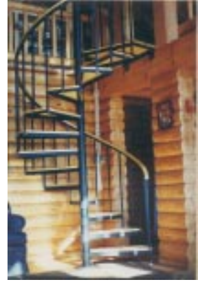
Fred built these spiral stairs that connect the first floor to the second in our log house.